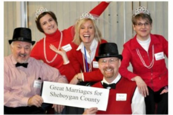
2011 Team Members:

A great time was had by all who participated and by those who attended the event to cheer us on. We had a slow start, but then with some serious team power, and a little help from our laser-light packed engagement rings, we came back strong and went on to a great victory in the third round!!! Yeah team!